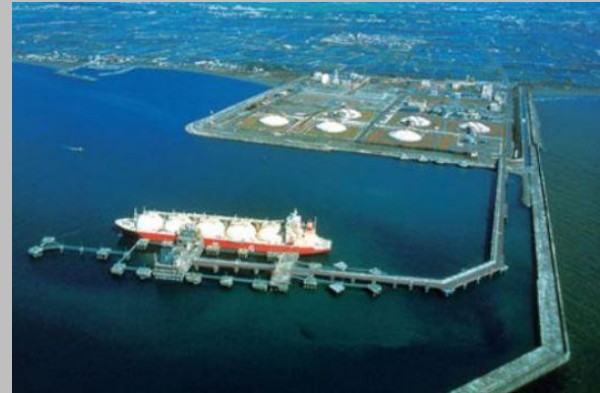
LNG cargo docked at terminal

January 2012, Japan imported an astounding 39 percent more LNG, an increase from 3,729,421 to 5,189,890 metric tons. In fact during the recent U.S. – Japan summit, President Barack Obama and Prime Minister Yoshihiko Noda addressed energy cooperation (specifically referring to natural gas) as a key pillar of the U.S. – Japan Alliance. With only one nuclear reactor reactivated, gas supply is clearly playing an important role in off-setting the 30 percent supply that nuclear energy comprised prior to 3-11. 13 Weak in natural resources, Japan is also investing heavily in upstream natural gas projects. 14 For example, a Mitsubishi-led consortium owns a 50 percent stake in the Cordova Shale gas project—an abundant shale gas reserve in Western Canada. 15 The consortium is studying the possibility of exporting the shale gas to Japan to diversify Japan’s energy imports and secure a stable energy supply. 16