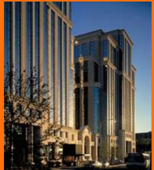
2300 Clarendon Boulevard Vornado Properties

For more information about the Institute, please visit us online at www.project2049.net .